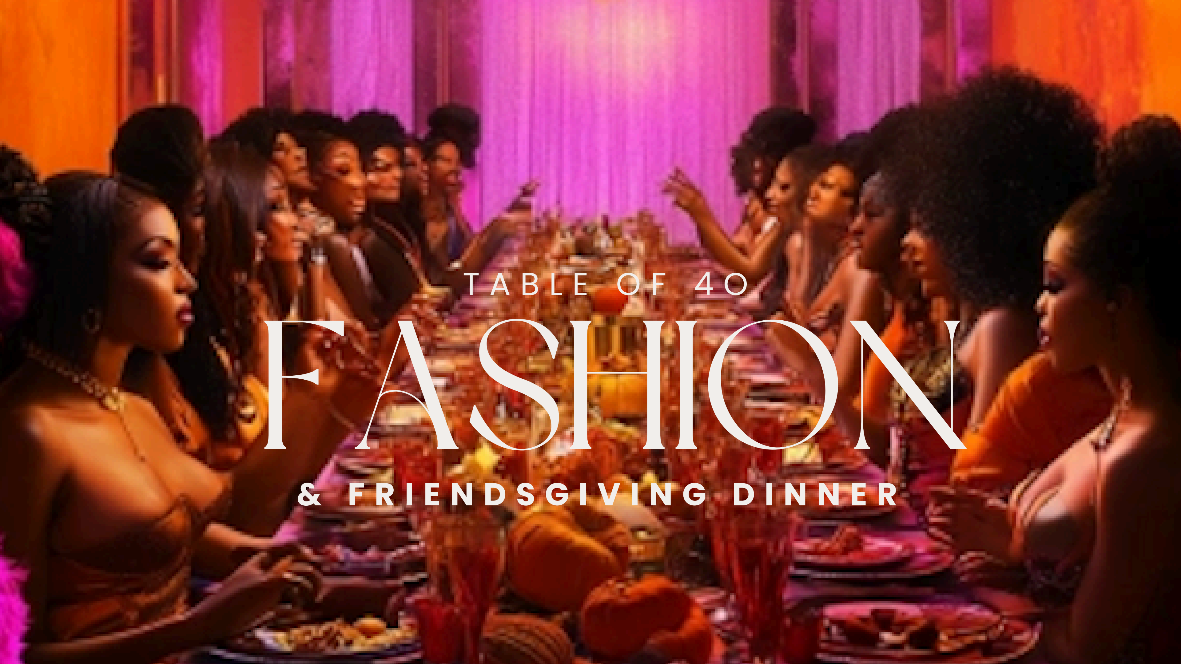
TABLE OF 40