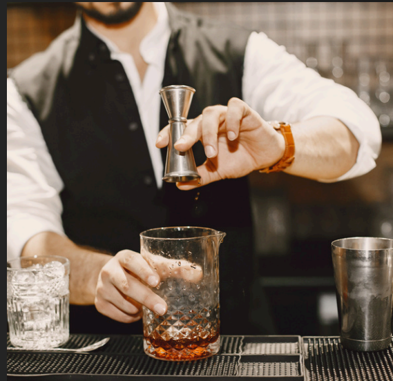
Bartender / Mixologist